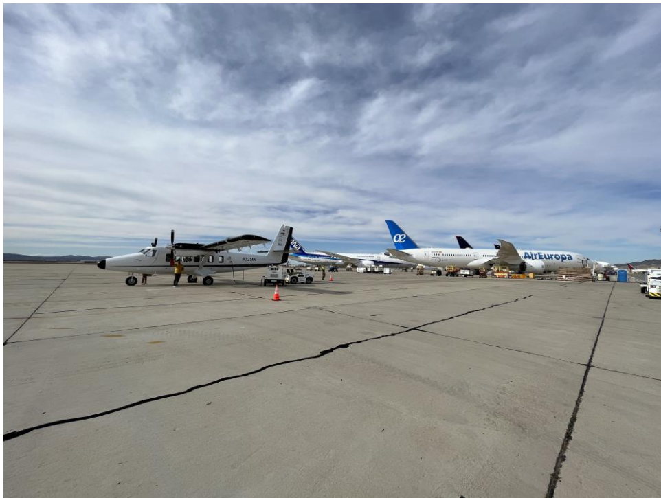
The reliable Otter amongst the many younger retired planes in Victorville CA, Photo by Abe.