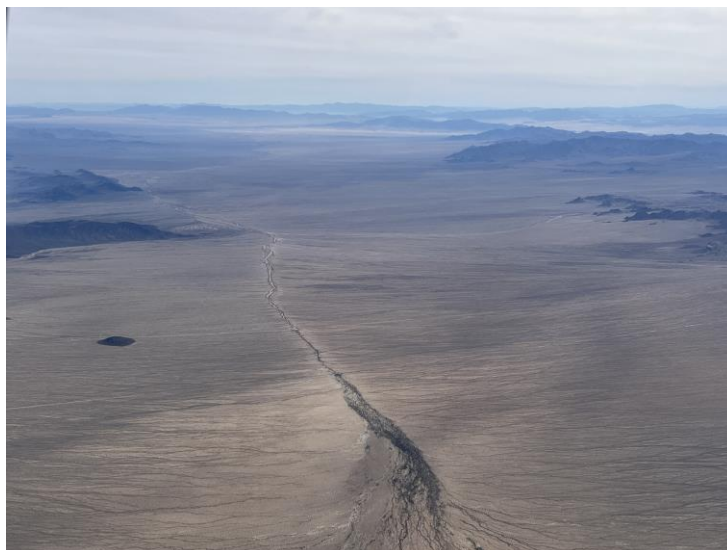
Stepladder Mountains Wilderness.