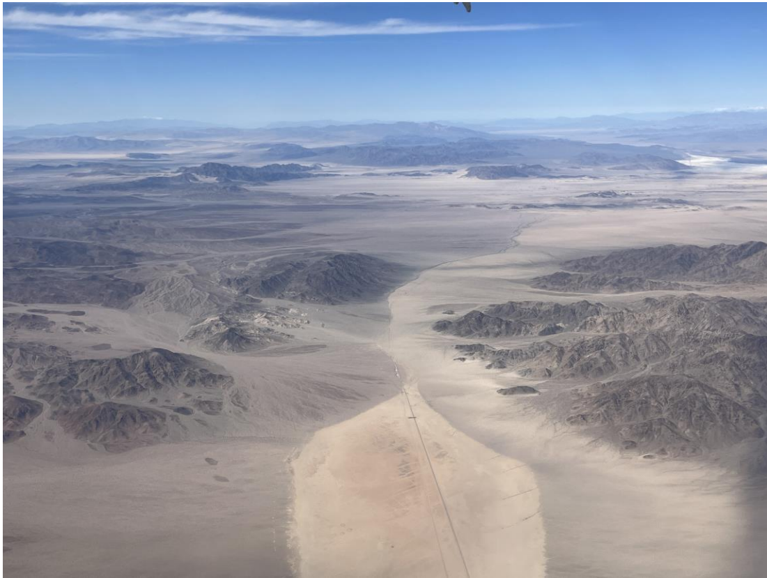
Broadwell Lake, south of Baker CA