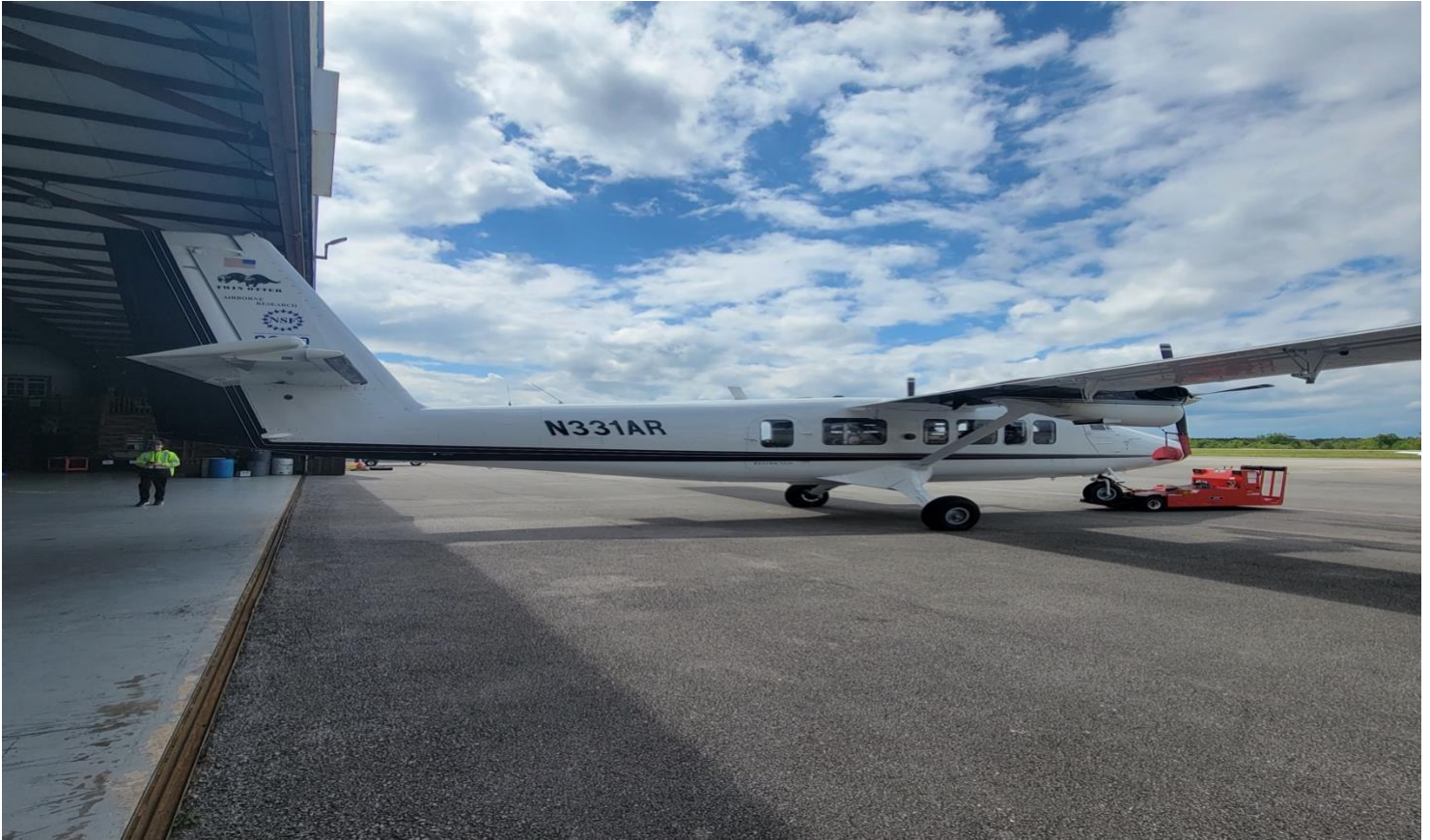
Above: The ground team in Bessemer ensuring the Otter fits in the hangar door! (Tail height 19'6" Door Height 19'8") Below: The Otter parked in Meridian Mississippi alongside several Navy/Marines trainer jets!