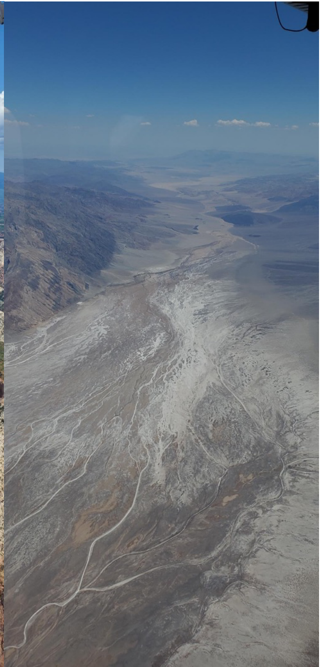
Death Valley National Park