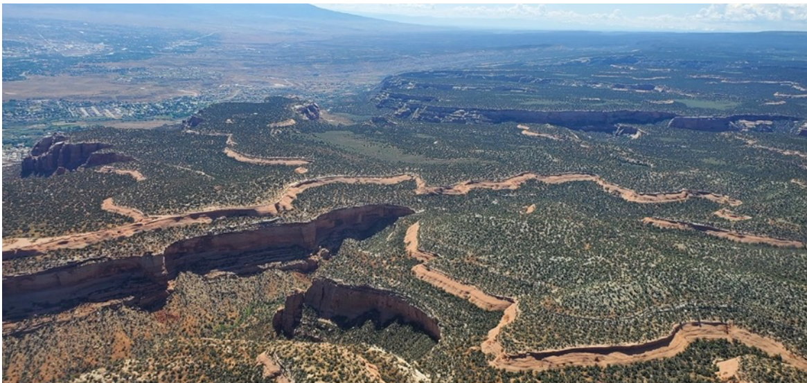
Colorado National Monument