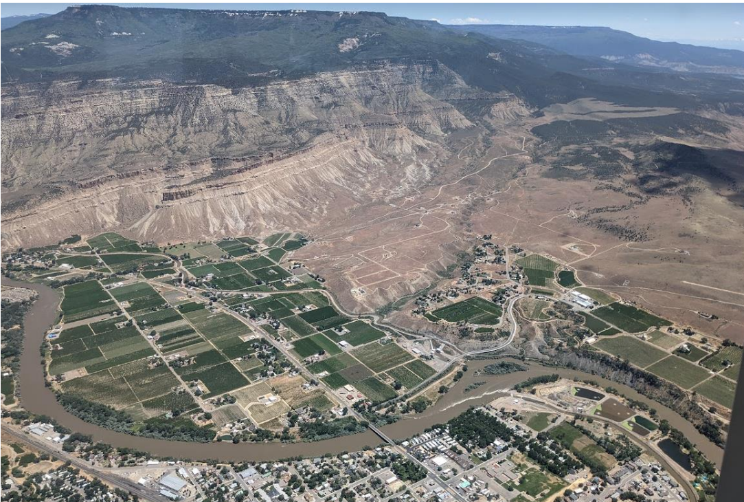
Flying over Palisade, CO on approach into KGJT.