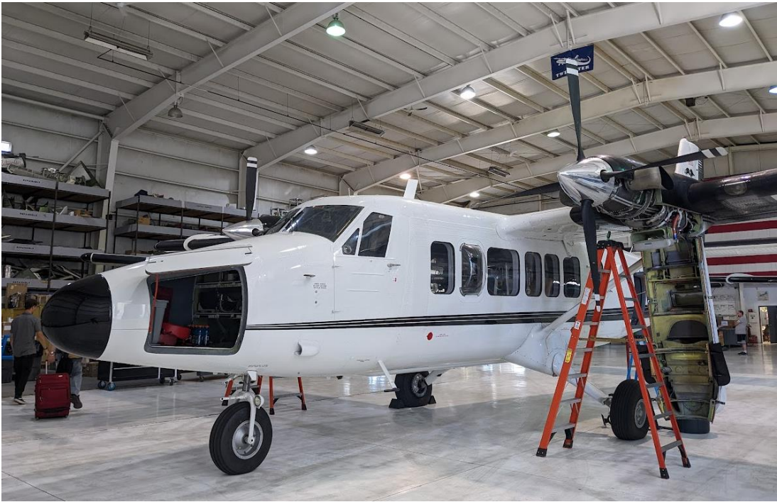
Readying the plane for maintenance at the Twin Otter hangar.