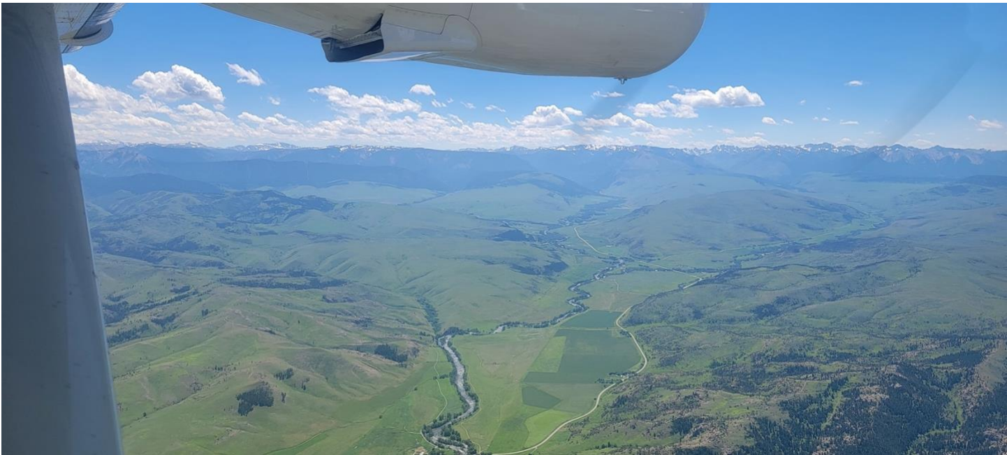
Above: A photo captured between Billings & Bozeman Montana during the transit. Below: The Twin Otter in front of the hangar in Bozeman.