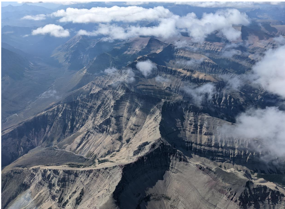
Scenic partly cloudy skies over Glacier National Park.