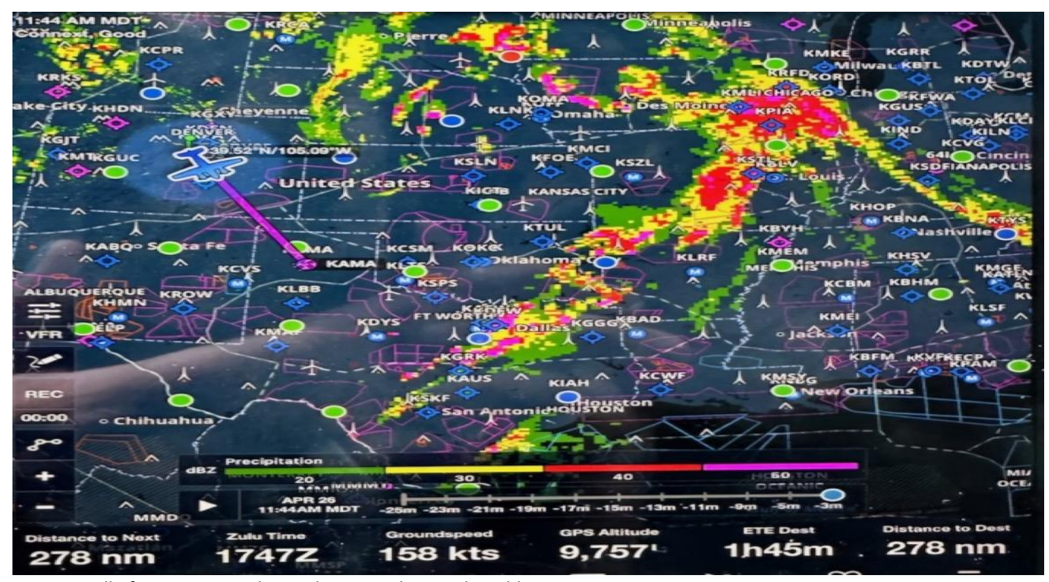
Top: A wall of storms noticed on radar as we departed Boulder. Bottom: Flying along the Red River, Texas / Oklahoma border in route to D03.