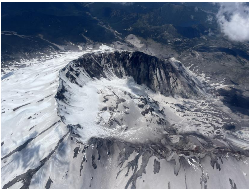
Mt St Helens from the Otter on the transit north.