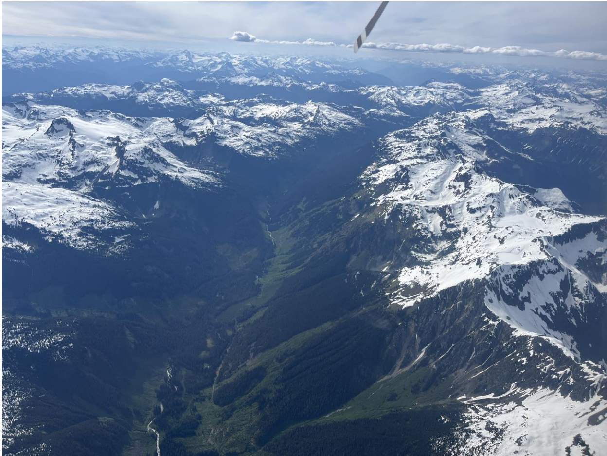
BC Canada, between Abbotsford and Prince George.