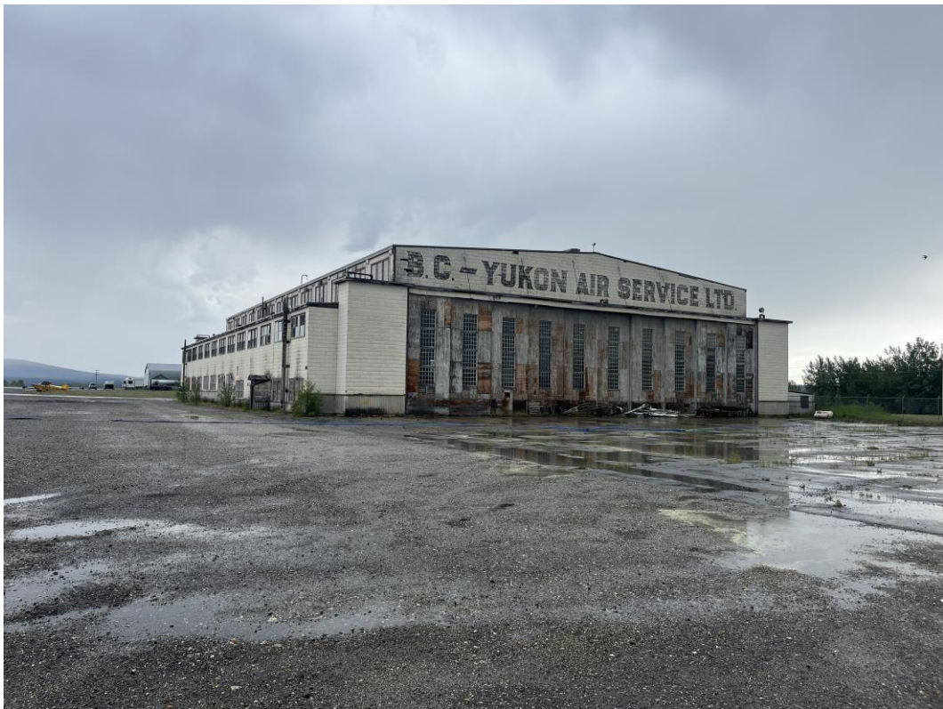
Abandoned Hangar in Watson Lake.