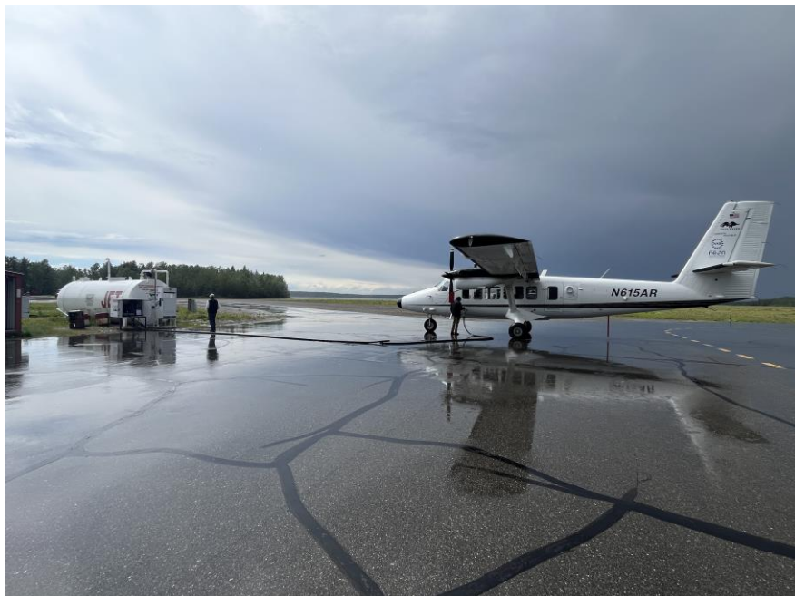
Self-serve fuel in Watson Lake YK.