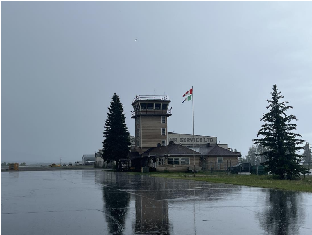
Watson Lake Terminal.