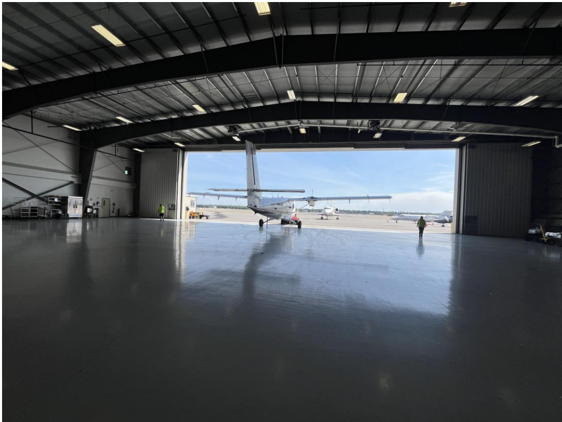
The Otters home for the next month. Atlantic Aviation Fairbanks.