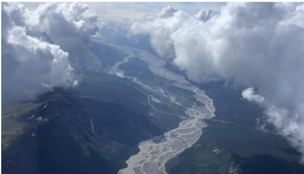
The Otter dancing through the clouds on the Canada/Alaska border.