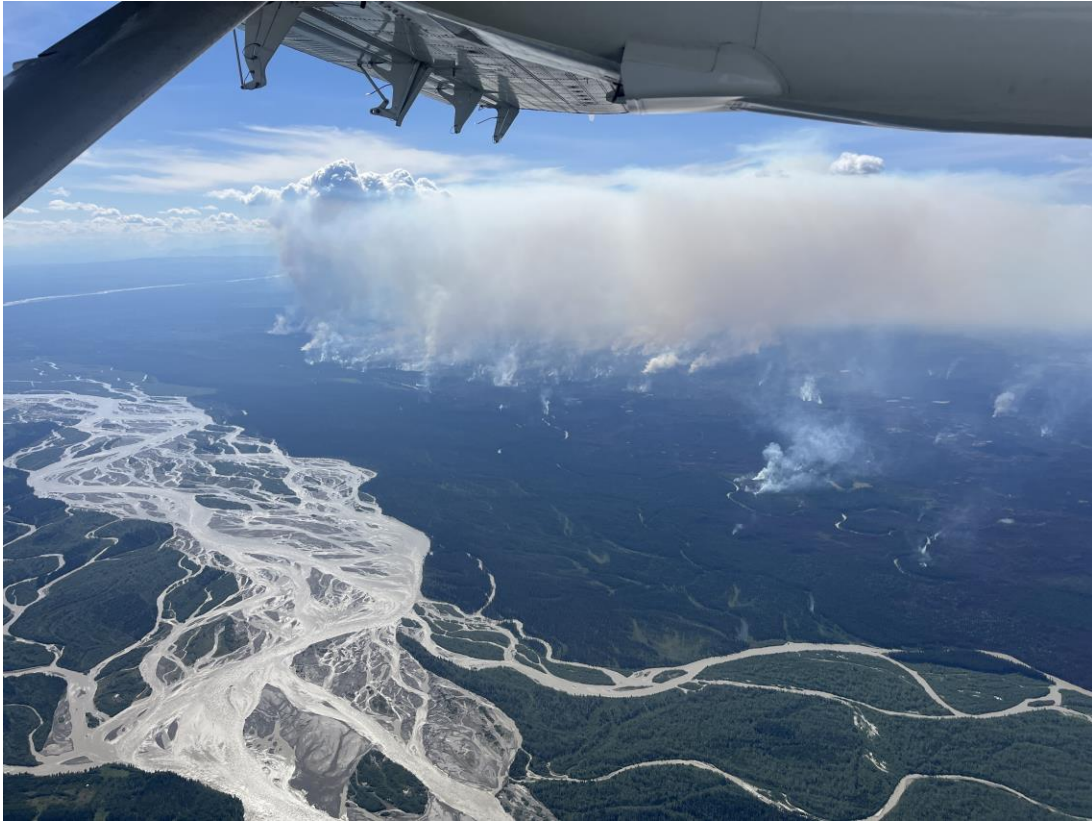
Some of the wildfires to the south of Fairbanks.