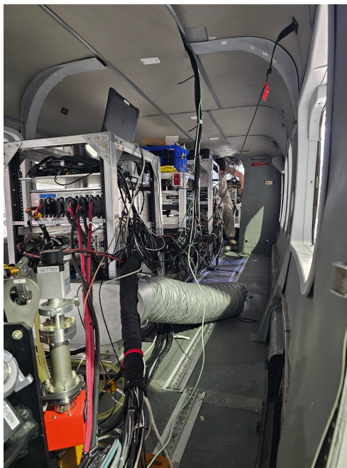
Payload racks moved for fuel cell access