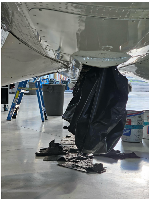
Fuel cells being pulled