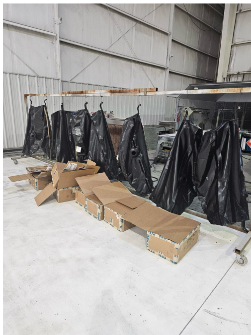
Fuel cells after removal