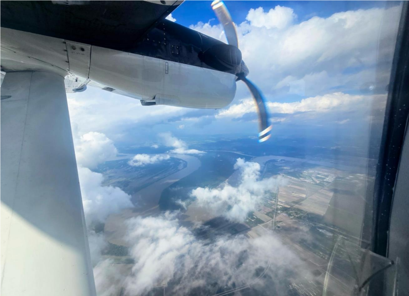
Meandering through the clouds crossing over the mighty Mississippi River.