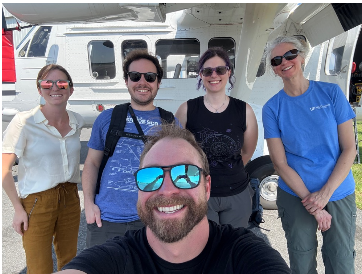
Photo from today's tour. Great to meet folks putting our data to good use!