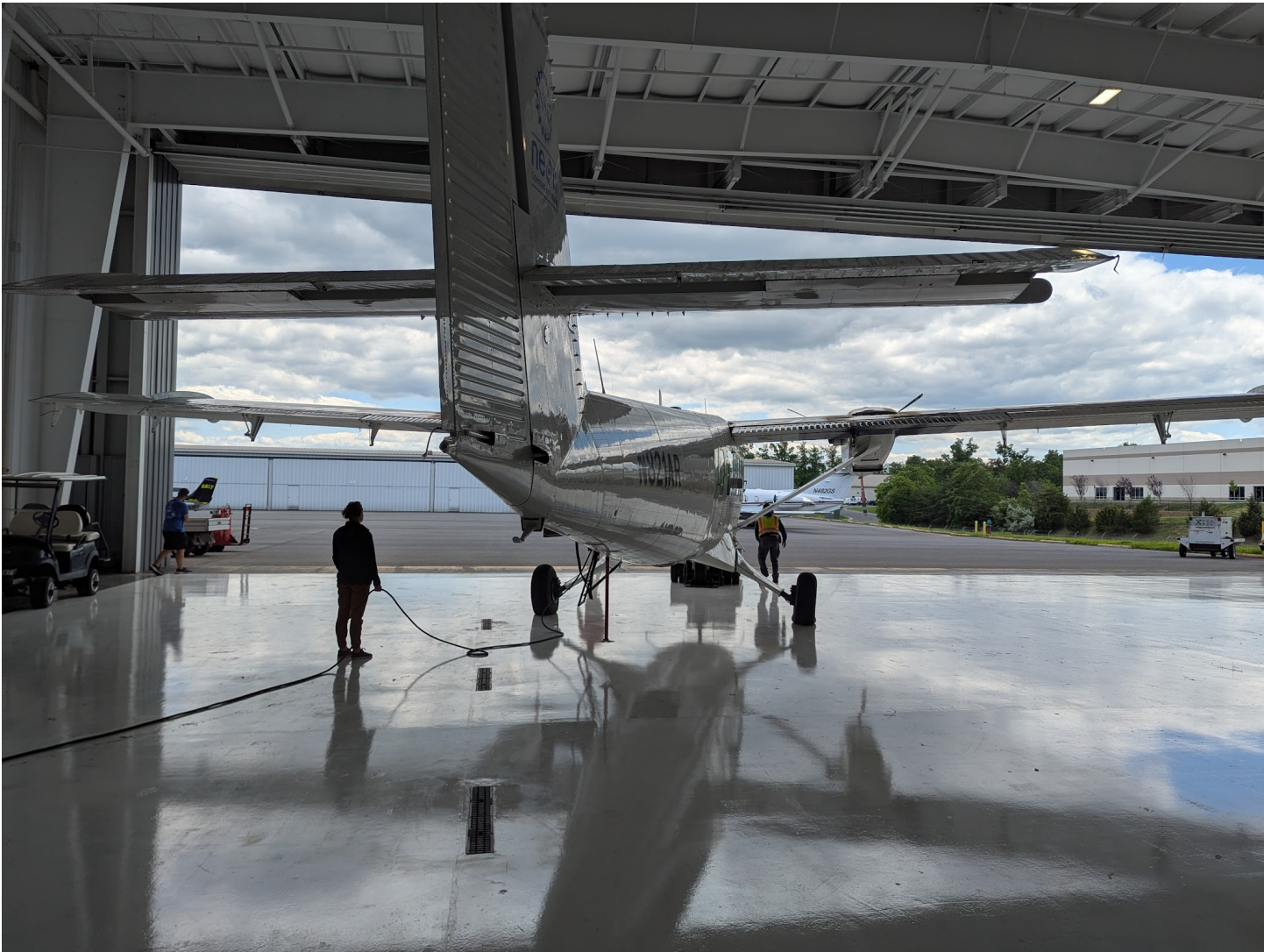
Above: The Otter adjusting to the comforts of a hangar after sitting outside in Boulder and Gainesville.