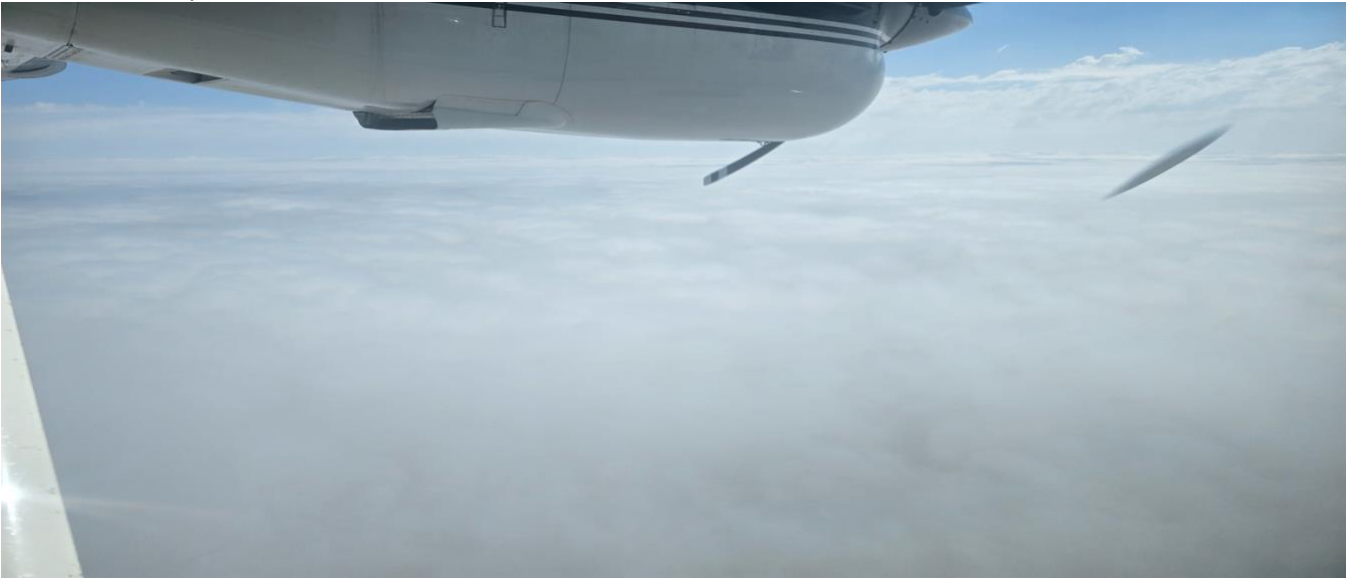
Bottom: Directly over BLUE