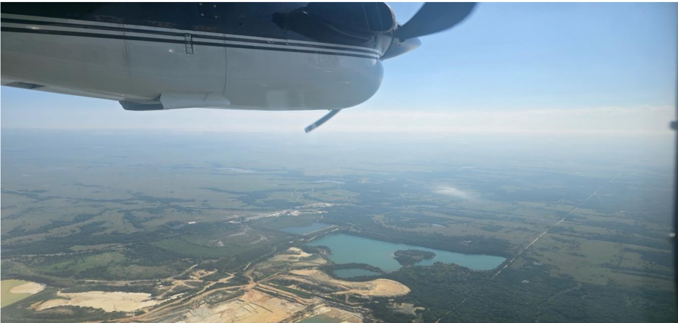
Top: In transit approximately 8NM from BLUE