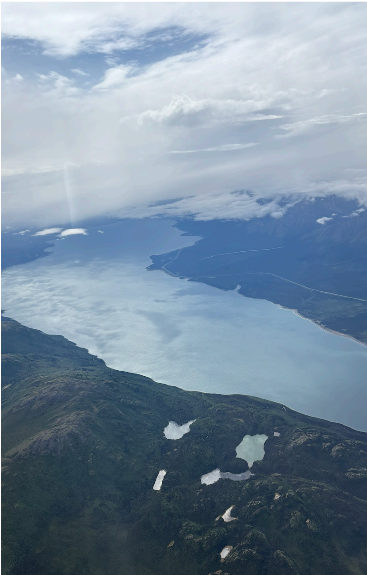
Clouds parted to give a nice view of Kluane Lake.