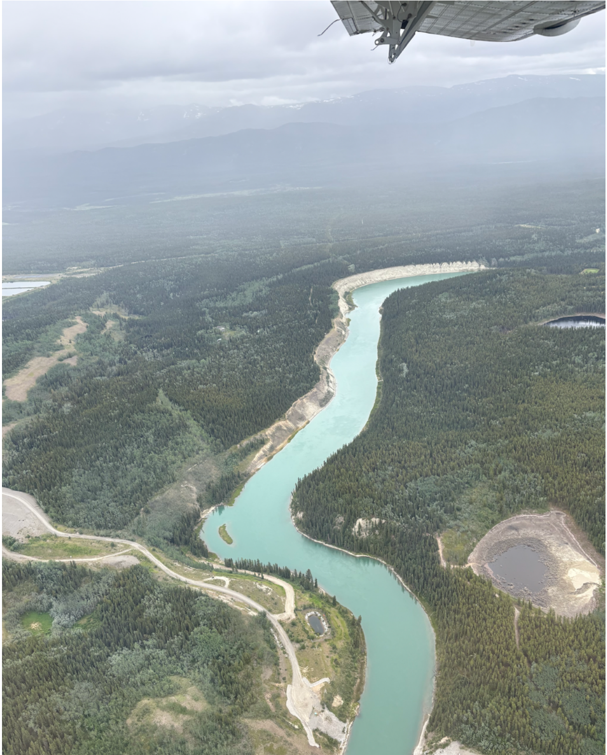
Yukon River looking pretty through Whitehorse.