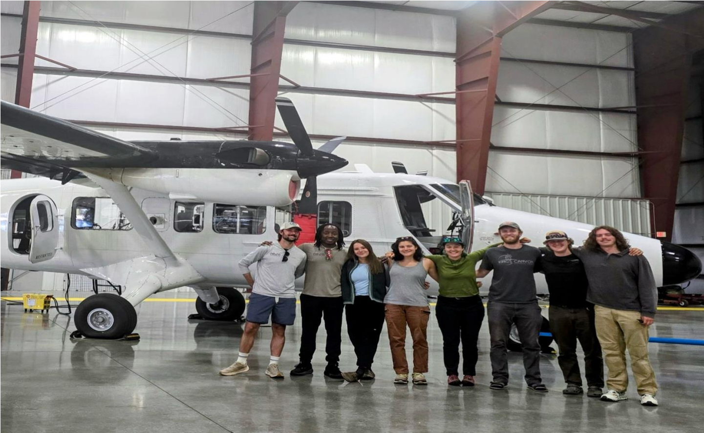
Pictures: Some members of the D12 field staff drop by to tour the AOP!