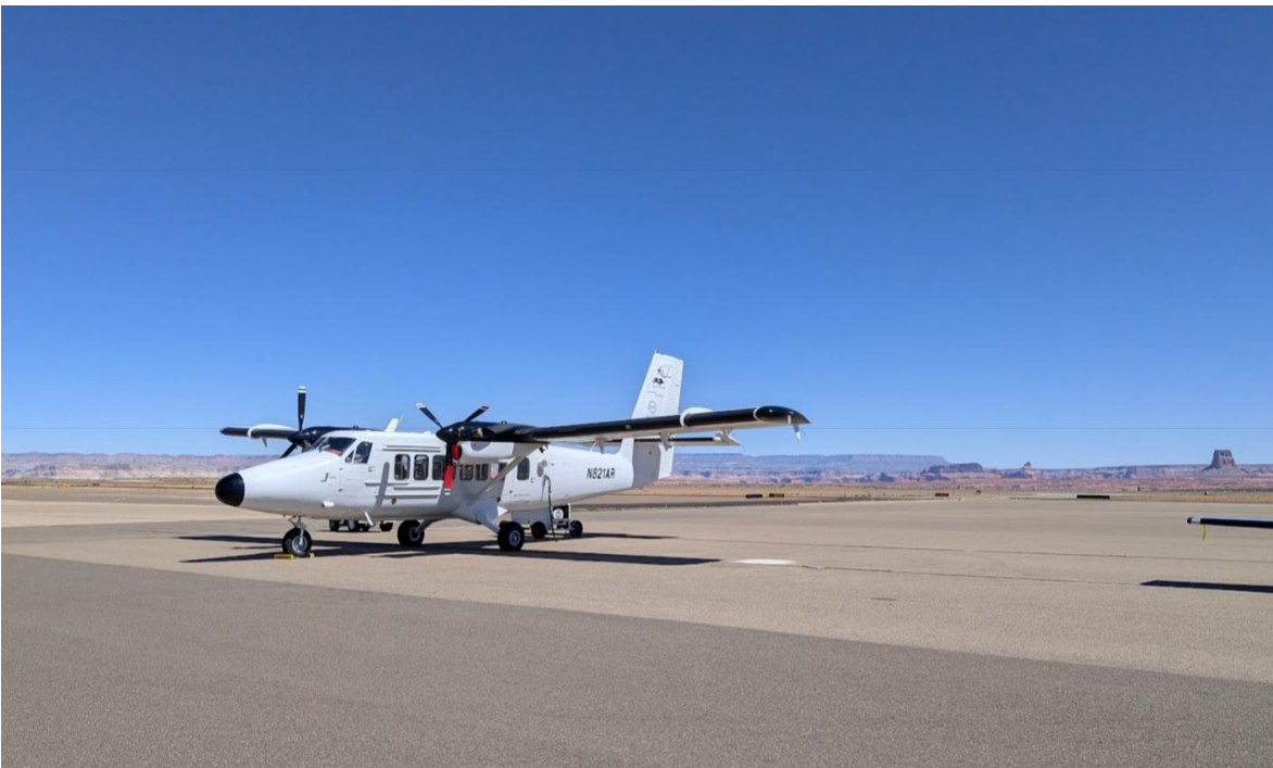
One of two fuel stops in Page, AZ.