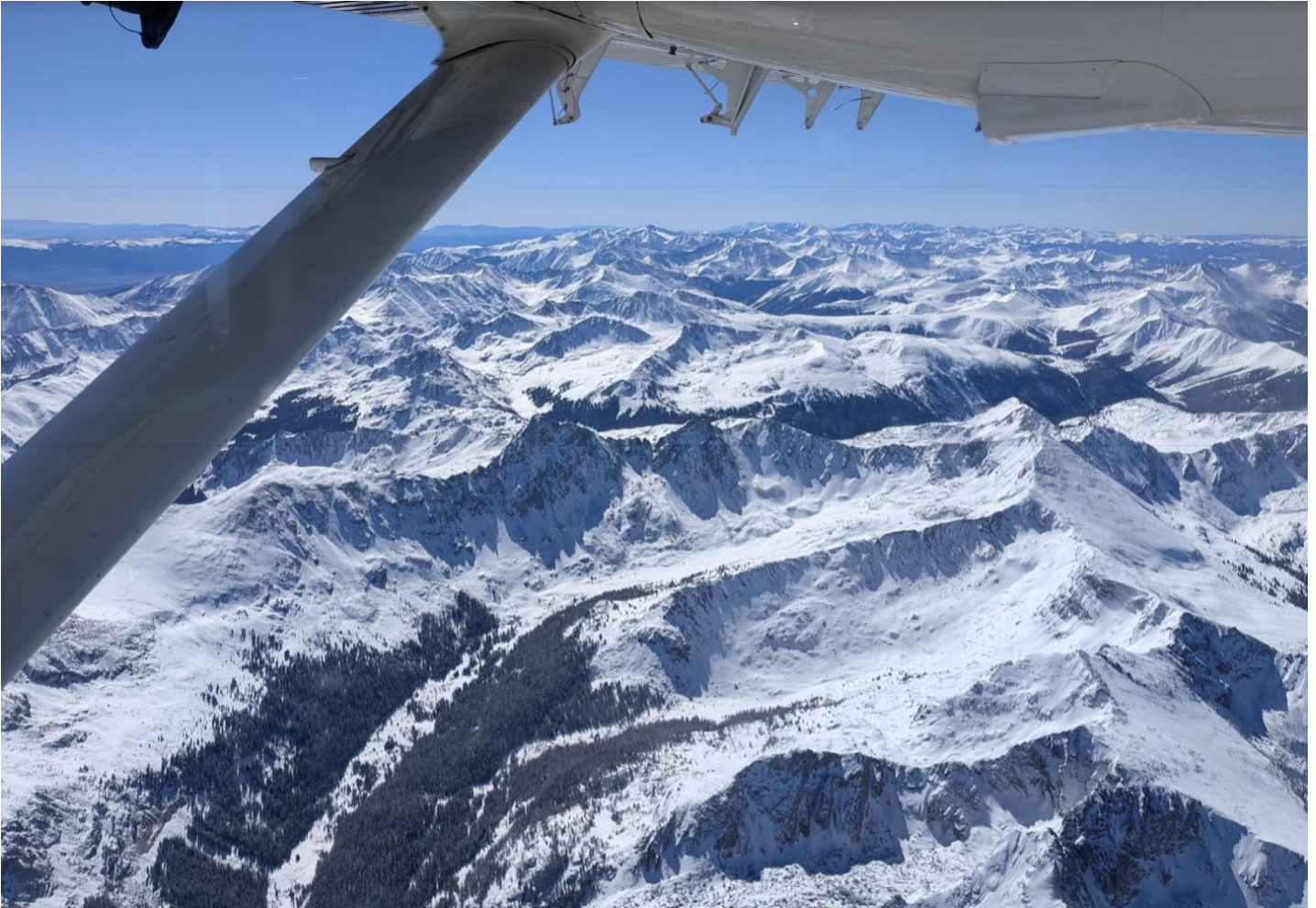
Bluebird conditions over the Colorado Rockies this morning.