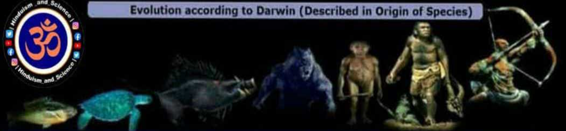
Chordates Living in Water (Fish)