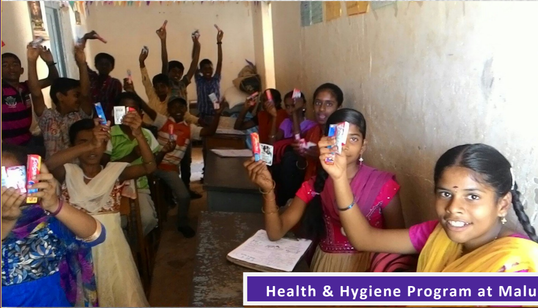
Health & Hygiene Program at Malur