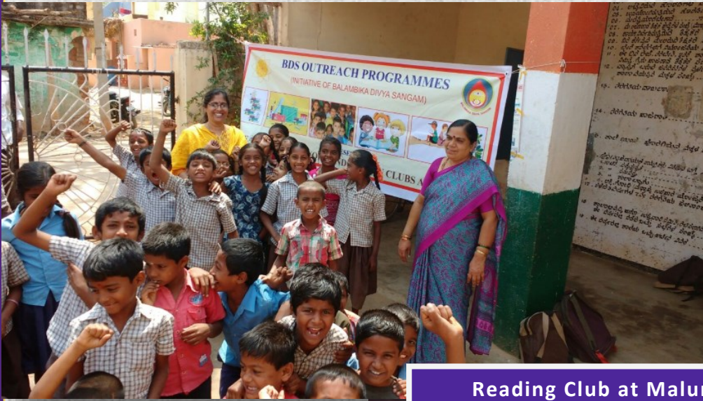
Reading Club at Malur