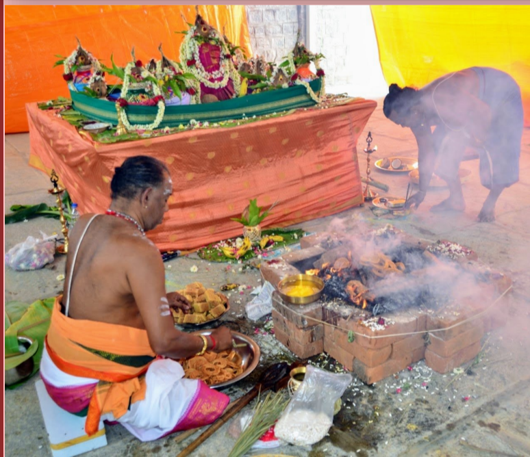
Shivacharyar Gurukkal performing Bala Tripura Sundari Homam offers palagaram to Ambal.