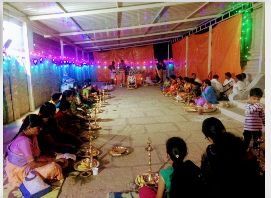
Devotees from Malur taking part in vilakku pooja