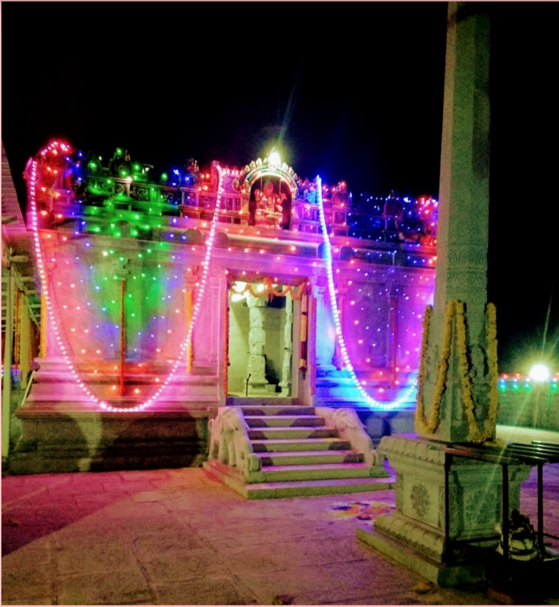
Malur Sri Raja Balambika Temple decorated with lights for anniversary celebrations