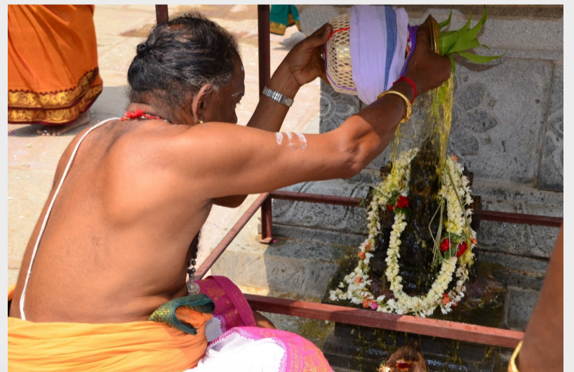
Kalasabhishekam for Vinayaka