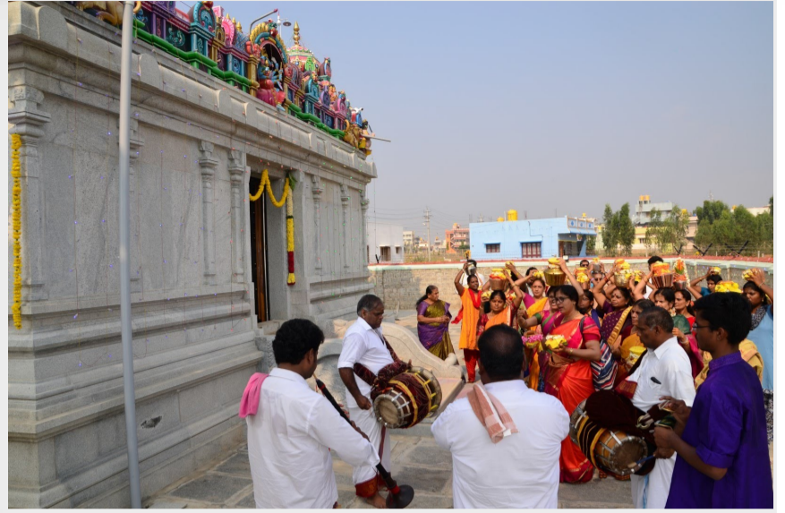
Enthralled devotees coming in a pradakshanam around the temple carrying Paal kodam for Abhishekam with musicians performing before them