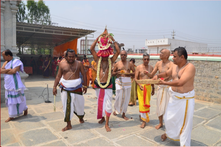
Bala Tripura Sundari Kalasa pradakshana around the temple before Kalasabhishekam and Gurukkal offering karpورا arati to devotees