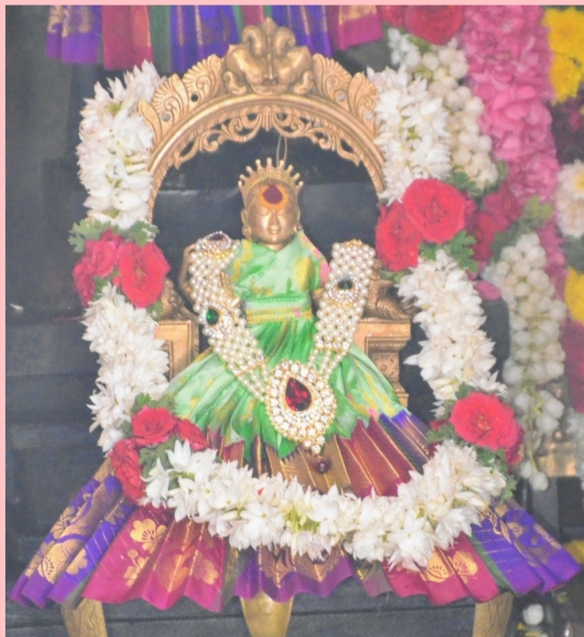
Raja Bala alangaram with prabhavali and Kutti Bala alangaram for the grand finale