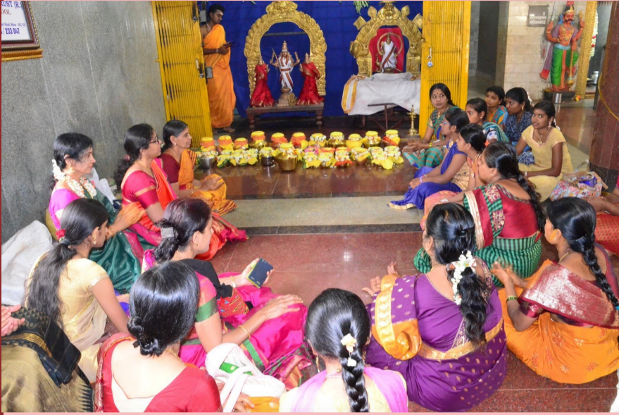
Bhajans at Sri Subramanya temple, just before the paal kodam procession