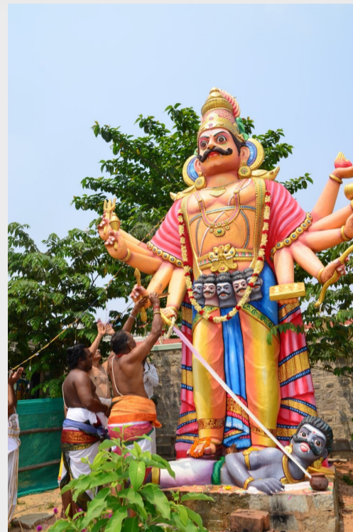
Gurukkal offering kar-pooram arati to Rudhra Veerabhadra Swamy