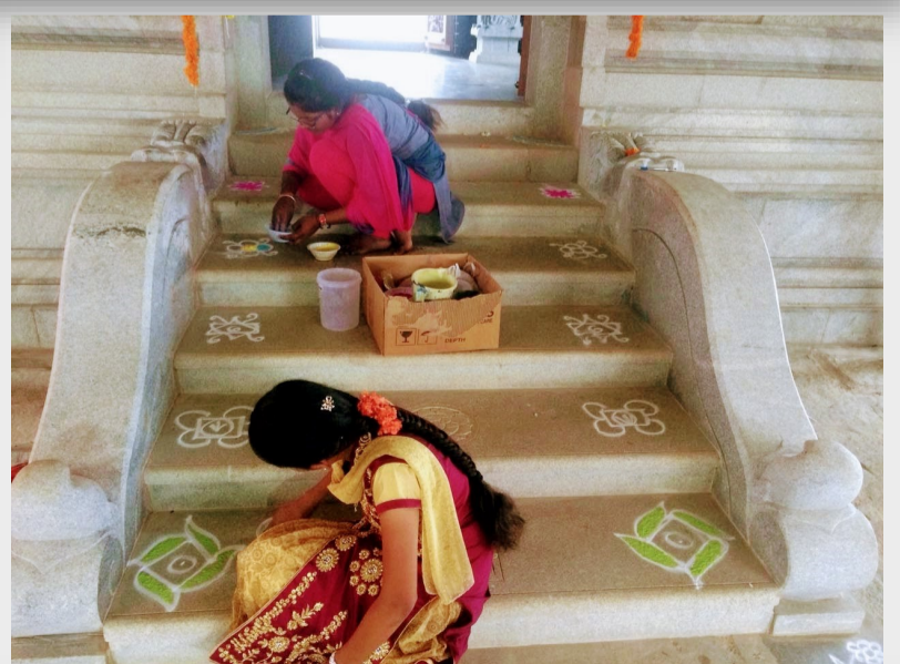
Devotees decorating the temple with kolam for the big event