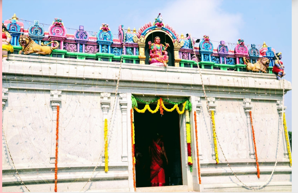
Temple decorations for the anniversary celebrations