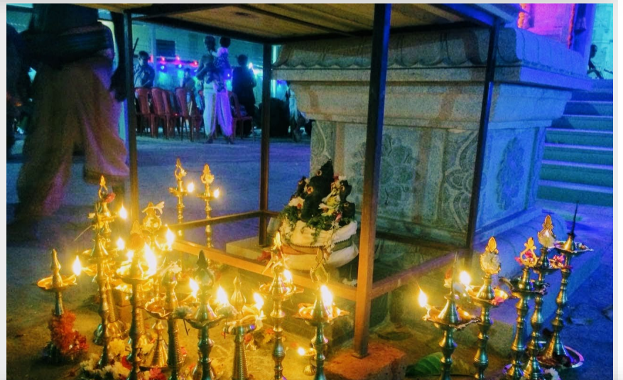
Devotees offered their prayers to Lord Ganesha after vilakku pooja