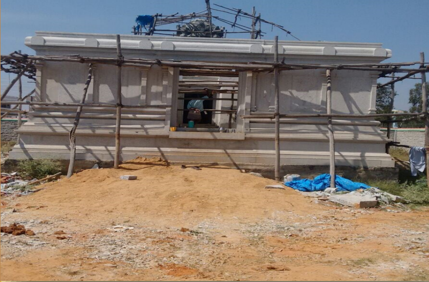
Front view of Mahamantapam

The construction of Sri Balambika temple at Malur is fast in progress and the mahamantapam has come to a stage of near completion. The flooring of the mahamantapam is now finished and the carving and erection work of the pillars in the hall are under progress. The roofing stones have been worked upon and are being prepared to be laid.