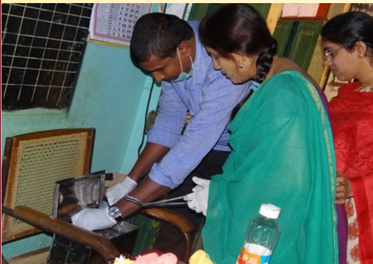
Sterilization of dental mirrors and probes