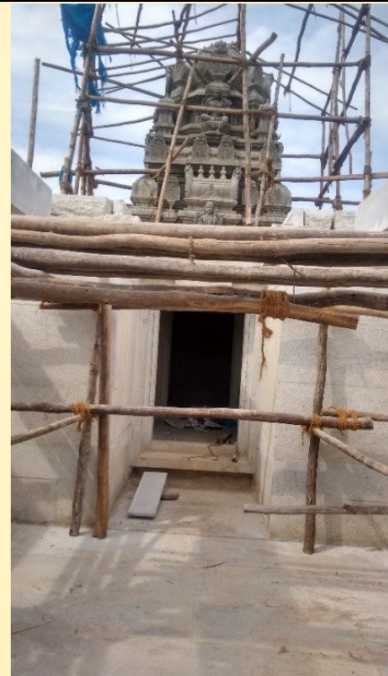
View of Garba Gruham from Mahamantapam