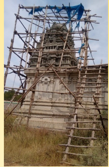
Side view of Garba Gruham and Vimana (Gopuram)