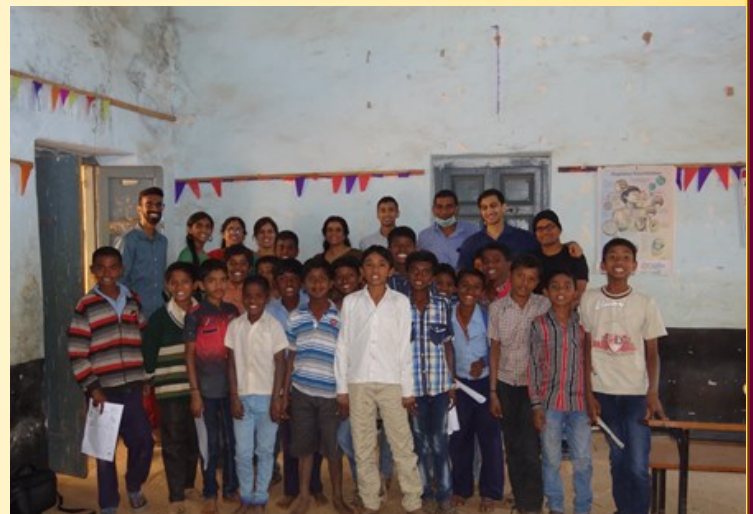
Students and BDS Team