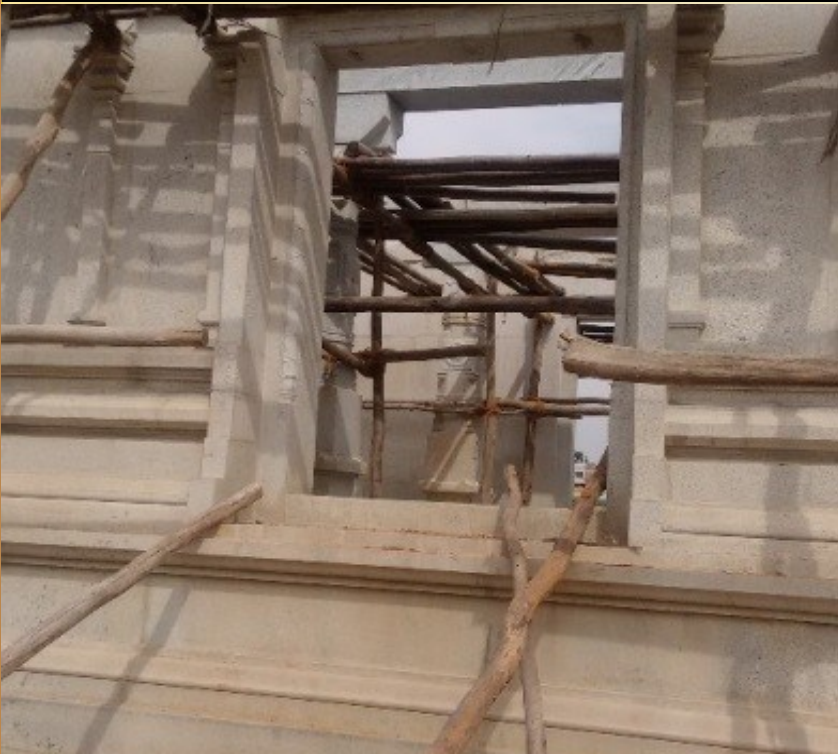
Side view into Mahamantapam