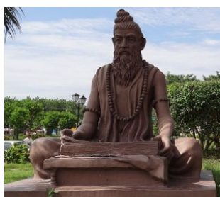
Maharishi Charak Author of the Charaka Samhita

Acharya Charaka (600BCE) has been crowned as the Father of Medicine. His renowned work, the "Charak Samhita", is considered as an encyclopedia of Ayurveda. Acharya Charaka revealed through his innate genius and enquiries the facts on human anatomy, embryology, pharmacology, blood circulation and diseases like diabetes, tuberculosis, heart disease, etc. In the "Charak Samhita" he has described the medicinal qualities and functions of 100,000 herbal plants. He has emphasized the influence of diet and activity on mind and body. He has proved that the correlation of spirituality and physical health contributed greatly to diagnostic and curative sciences. He has also prescribed an ethical charter for medical practitioners two centuries prior to the Hippocratic oath.