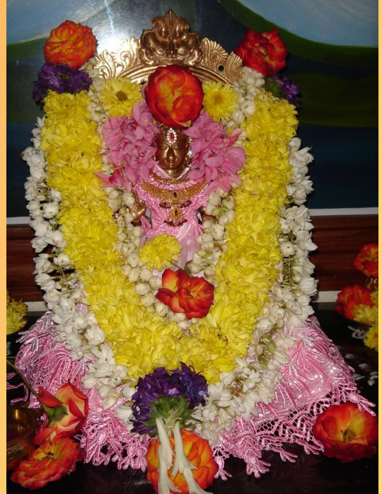
Jan 1st 2012