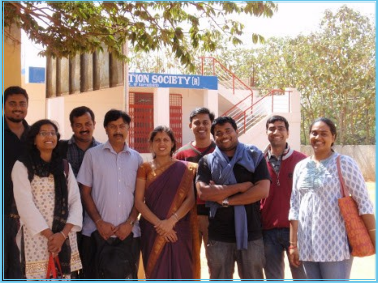
Balambika Yuvasena team — fostering young minds, and empowering them for the future