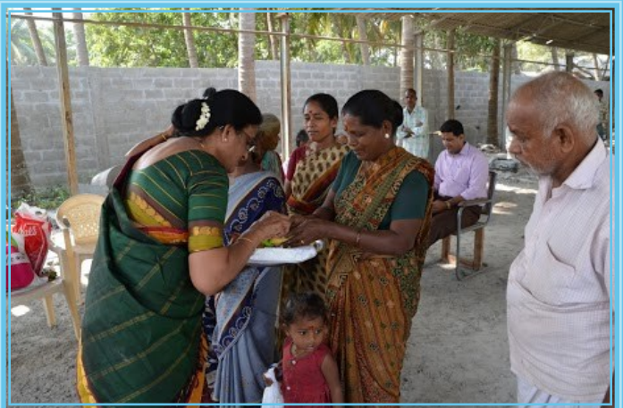
Honoring the families of the shilpis