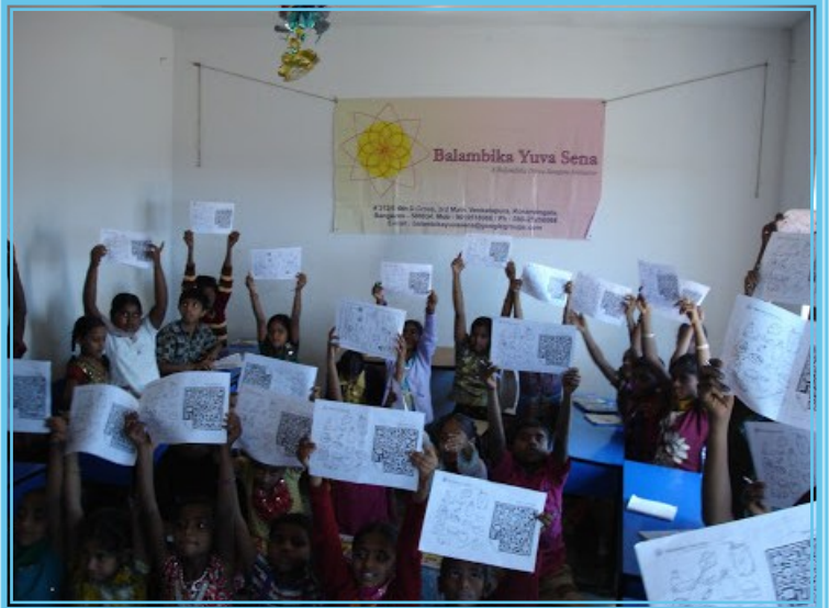
A classroom full of enthusiastic participants