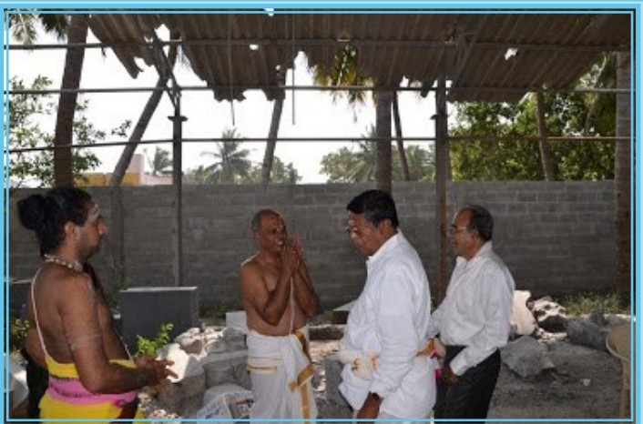
Shilpis take their first cut on this auspicious event