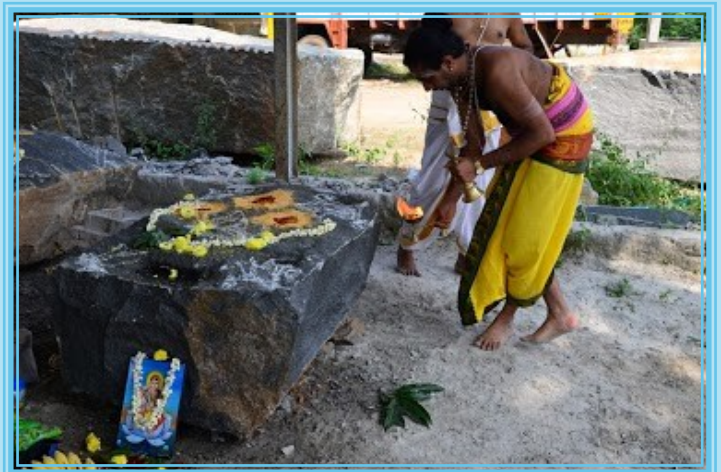
Vinayaka poojai, followed by sankalpam and poojai for the vigraham