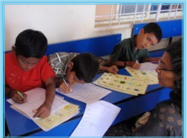
Interactive classroom activities relating to dental hygiene