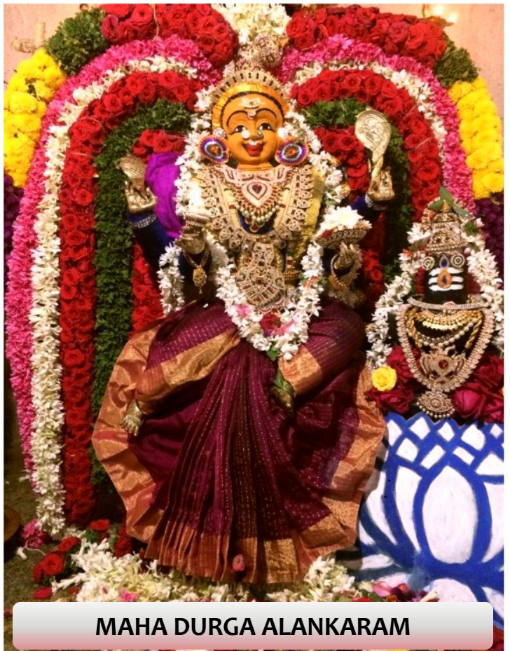
MAHA DURGA ALANKARAM