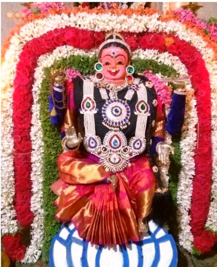
BALA TRIPURASUNDARI ALANKARAM