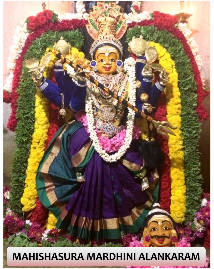
MAHISHASURA MARDHINI ALANKARAM