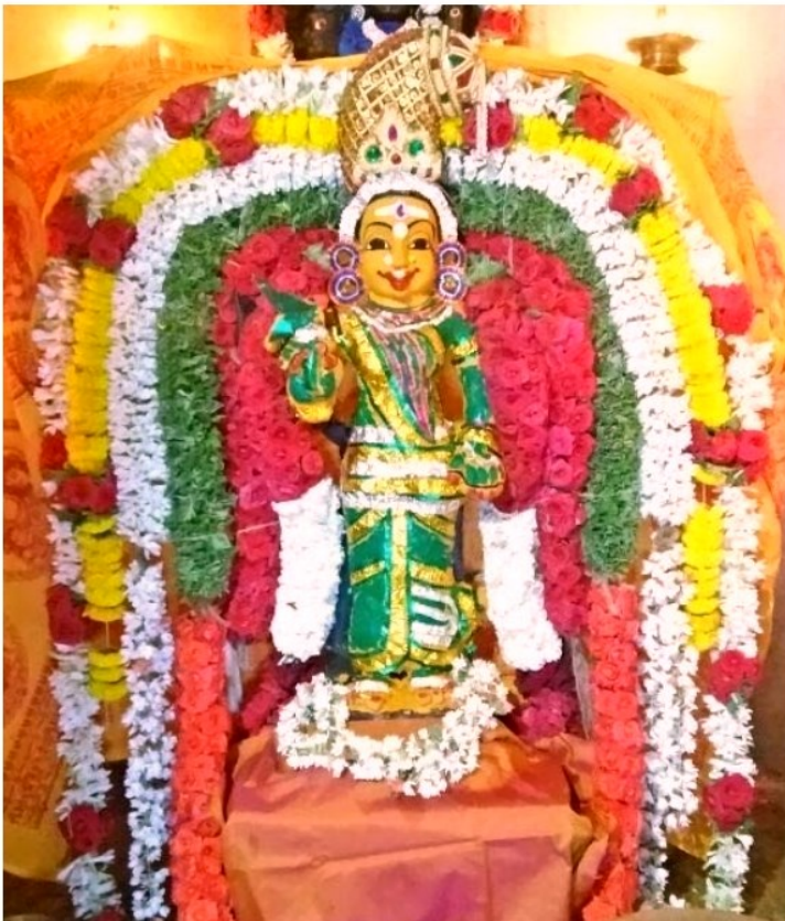
MEENAKSHI AMBAL ALANKARAM