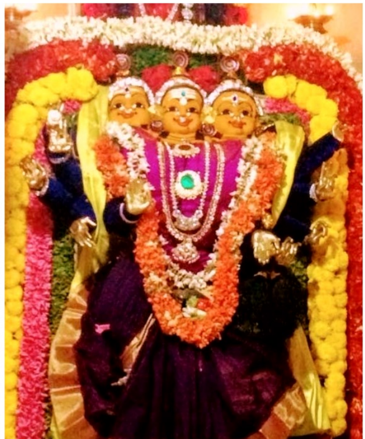
SRI GAYATHRI DEVI ALANKARAM