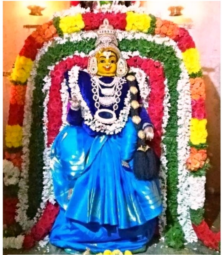
MANGALA GOWRI ALANKARAM