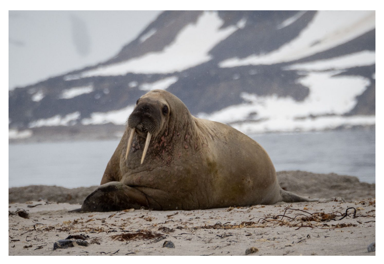
The true "king of the Arctic"