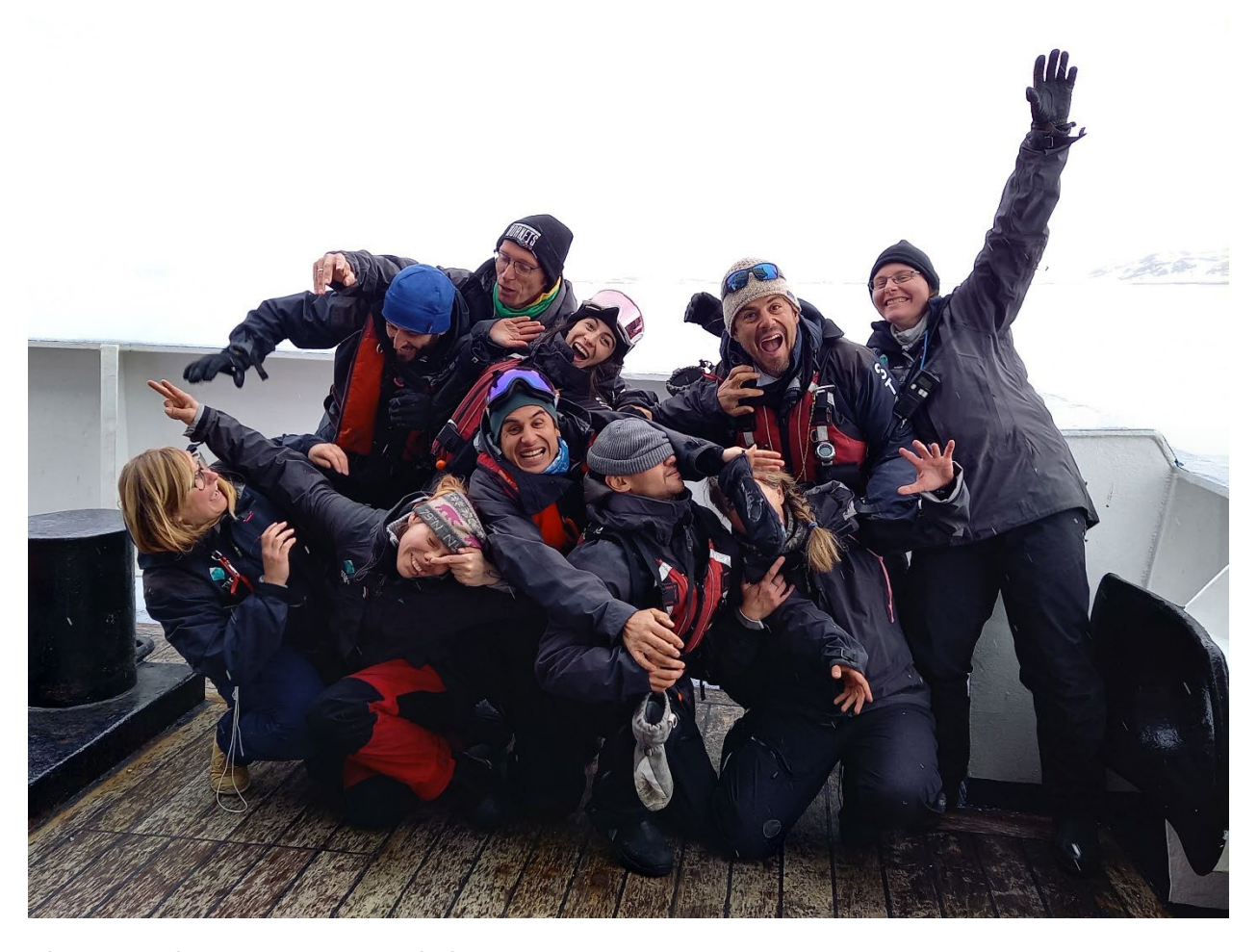
The expedition team says hi!