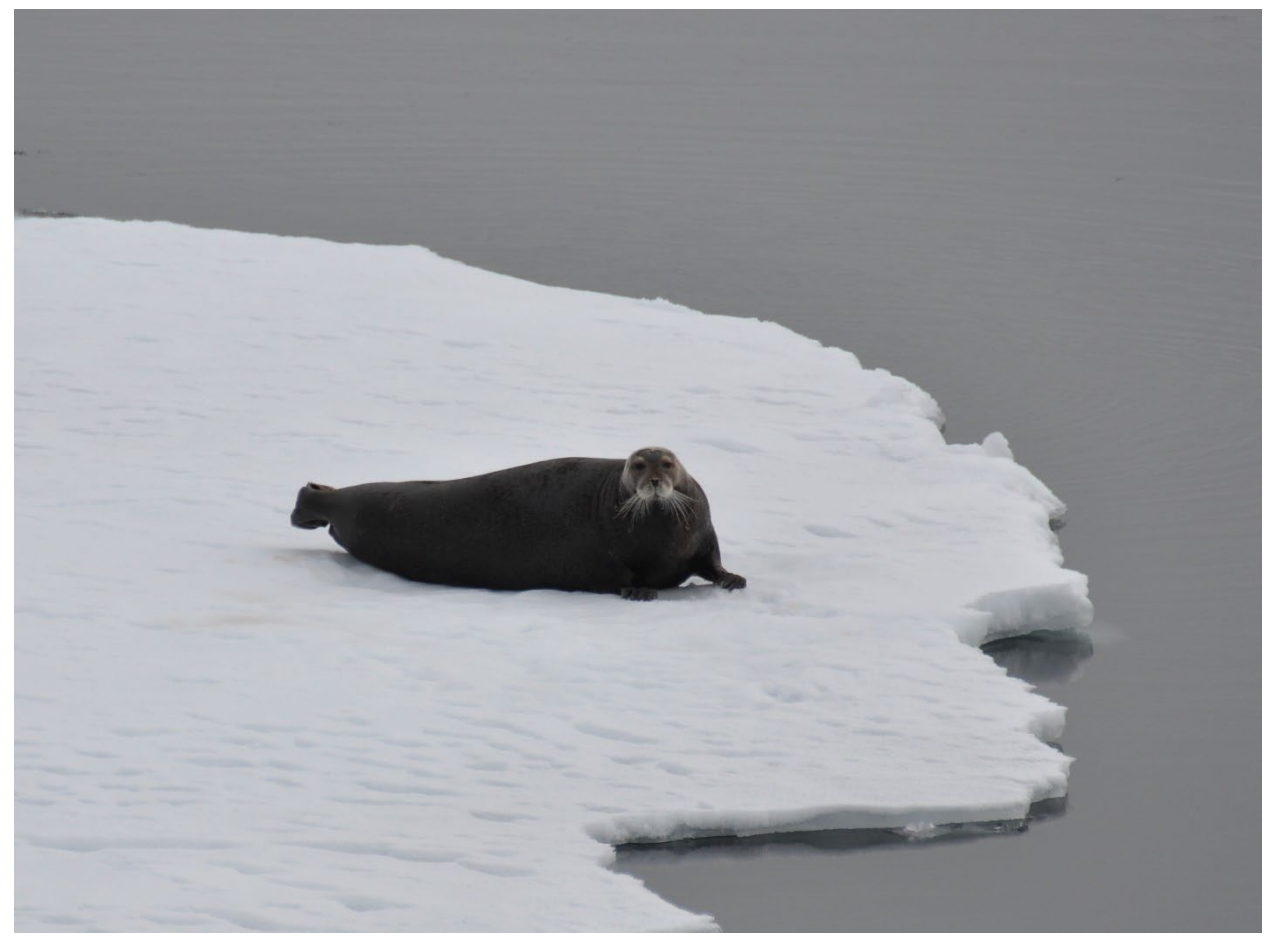
It is obvious where the bearded seal gets its name from

The afternoon is again spent cruising the pack ice. This time we find a bearded seal on a floe and have a long time to observe it.