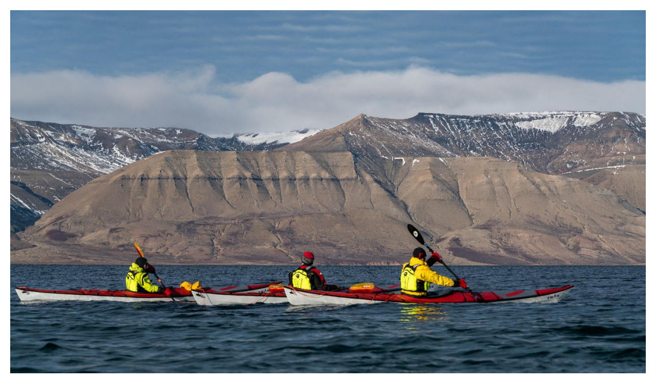
Once again a very different environment in which we paddled and a beautiful morning on the water.