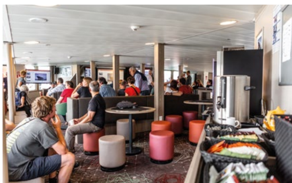
Bar & Observation lounge