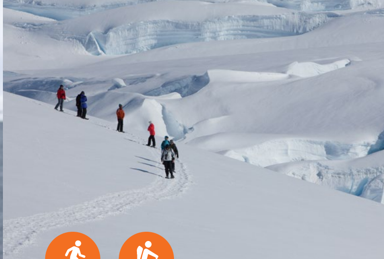
Photo workshops are free of charge. The group size per outing is limited to 20 participants. Please note, we do not supply any photography equipment.