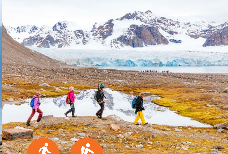
Photo workshops are free of charge. The group size per outing is limited to 20 participants. Please note, we do not supply any photography equipment.