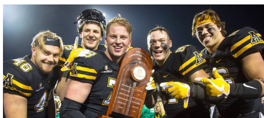
The Mountaineers clinched a Sun Belt title by closing the regular season with a 63-14 win against Louisiana on Senior Day.