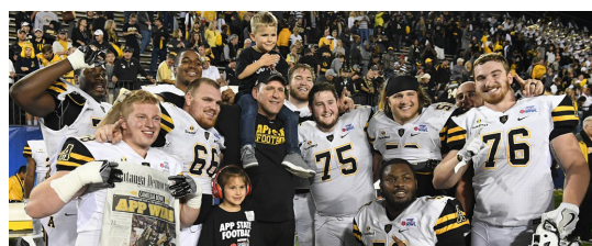
Thanks to a tiebreaking field goal with 5:41 left, App State won 31-28 against Toledo in a return trip to the Camellia Bowl.