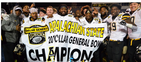
App State shut out high-scoring Toledo en route to a 34-0 victory in the Dollar General Bowl in Mobile, Ala.