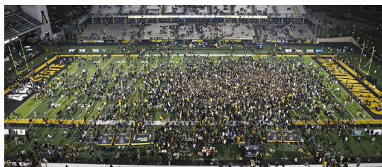
The 30-27 home victory over Coastal Carolina in 2021 helped App State go 7-1 in the Sun Belt and win the East Division title.