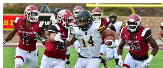
Out in Las Cruces, N.M., App State earned a share of its first FBS league title with a win at former Sun Belt foe New Mexico State.