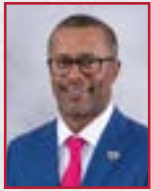
Hagerty Family Head Coach Willie Taggart

1-of-10 FBS Head Coaches with a son on the team