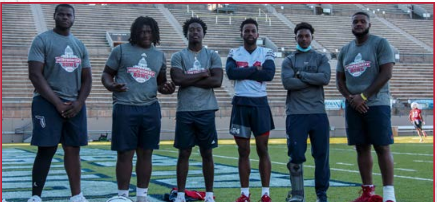
Alabama Natives at 2020 Montgomery Bowl