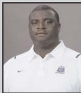
Dealton Cotton Defensive Line