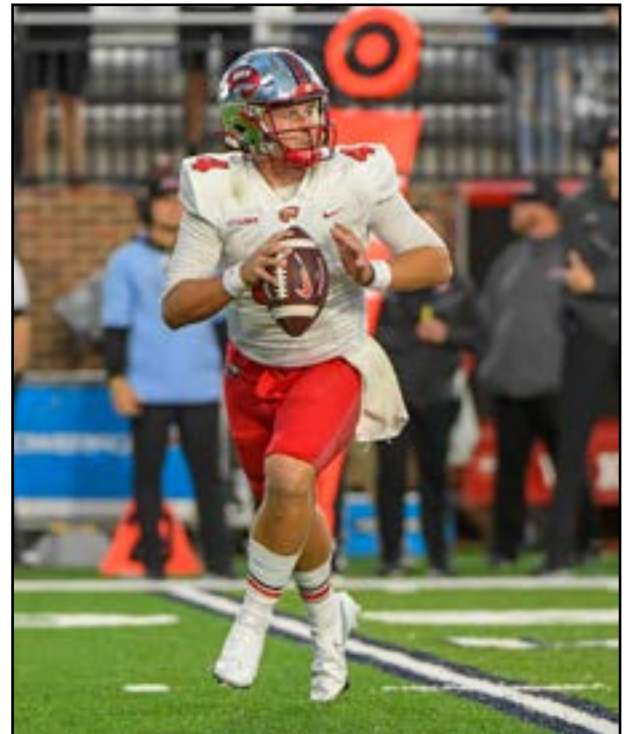
WKU holds a 6-1 advantage in the all-time series against Old Dominion, including a 43-20 victory the last time the two programs met on Oct. 16, 2021, at S.B. Ballard Stadium.