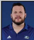
Rip Rowan Defensive Line - Field