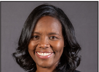
NIKKI MCCRAY-PENSON HEAD COACH | THIRD SEASON