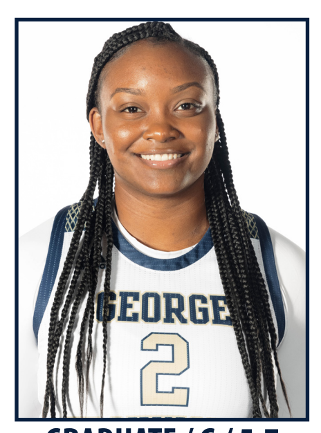
GRADUATE / G / 5-7 DANVILLE, ILL PURDUE FORT WAYNE MAJOR: SPORTS MANAGEMENT