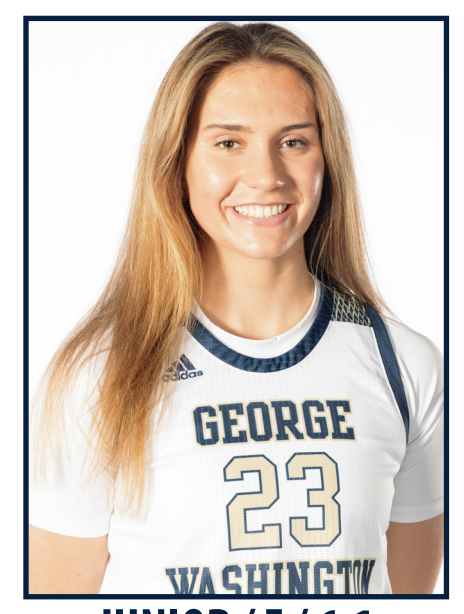
JUNIOR / F / 6-1 BOOTHBAY, ME BOOTHBAY REGION MAJOR: ACCOUNTANCY