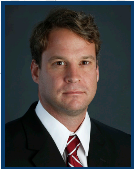
LANE KIFFIN HEAD COACH FIELD