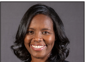
NIKKI MCCRAY-PENSON HEAD COACH | THIRD SEASON