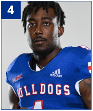
SOPHOMORE DEFENSIVE BACK