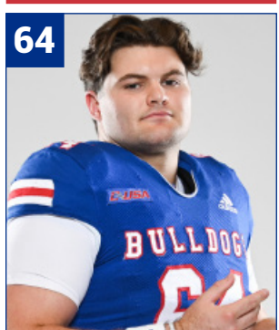
JUNIOR OFFENSIVE LINEMAN