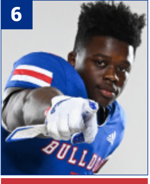
SOPHOMORE WIDE RECEIVER/PUNT RETURNER