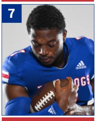
GRADUATE RUNNING BACK