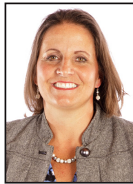
Jennifer Rizzotti Head Coach | 5th Year Connecticut '96