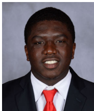
Devin Singletary Running Back