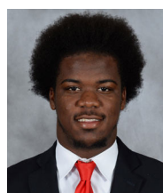
Azeez Al-Shaair Linebacker