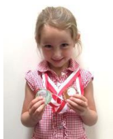
Peony – Ash Class

We have fourteen Superstars to celebrate this week: