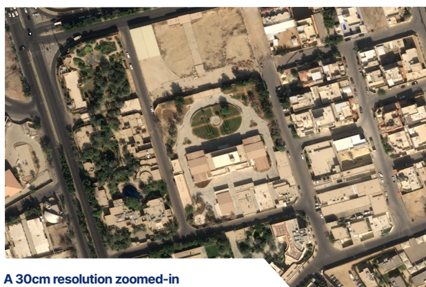
A 30cm resolution zoomed-in image of Kabul, Afghanistan.

Airbus updates its Global Basemap twice per year, ensuring defence teams have access to the most current geographic data, including changes in infrastructure, terrain, and road networks, which are essential for route planning and navigation in rapidly evolving scenarios.