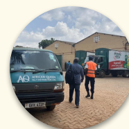
Distributors and Aggregators