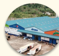
Suppliers and Manufacturers