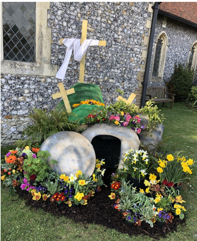
He is risen!