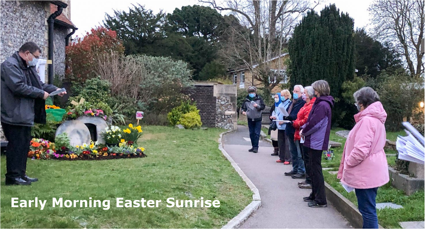
Early Morning Easter Sunrise