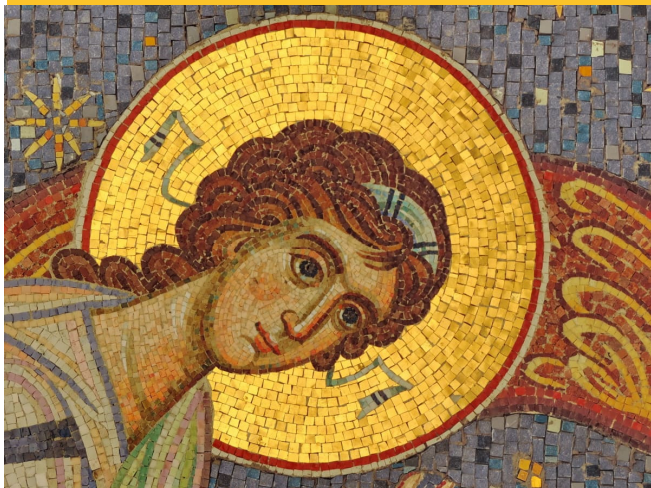
Byzantine-style mosaic of a saint