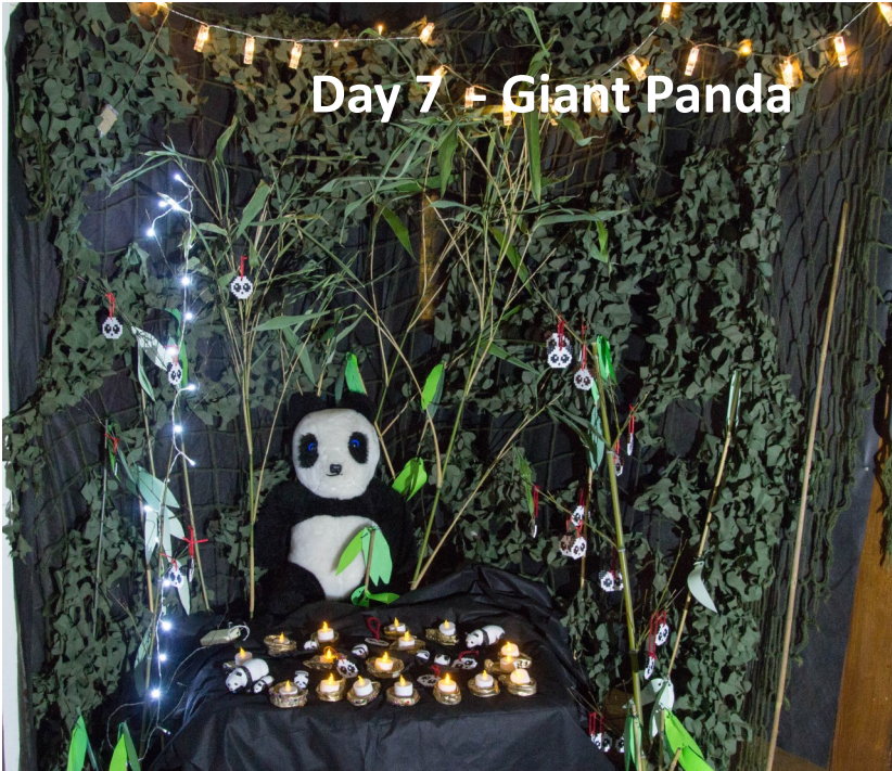
Day 7 - Giant Panda