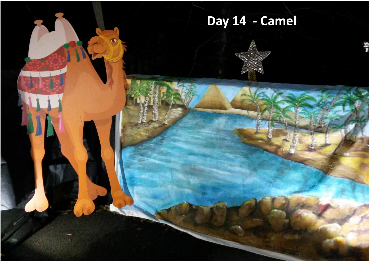
Day 14 - Camel

What will you give to Him this Christmas ?