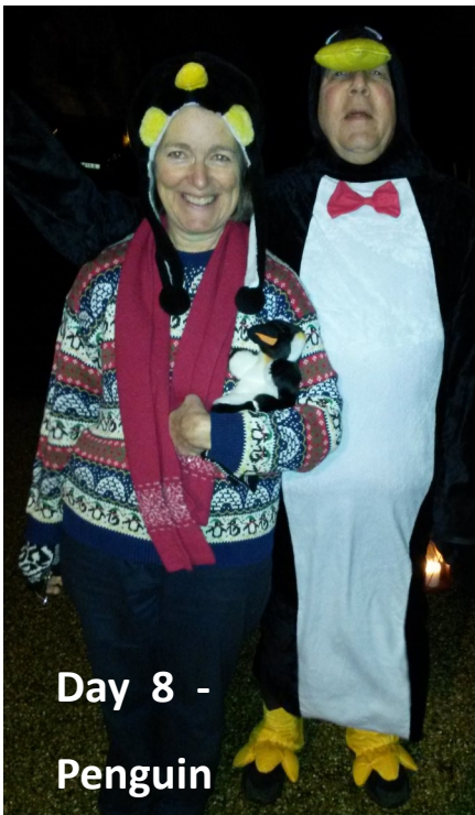
Day 8 - Penguin