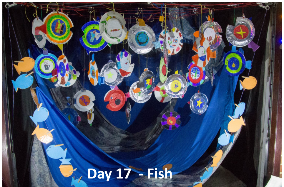
Day 17 - Fish

The Sanderstead ADVENTure finished on Day 24 at the Crib